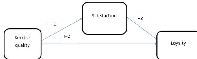
Figure 1: Conceptual model of the reseach

CFA to examine whether these variables were highly correlated and whether the model fit for collected data or not.