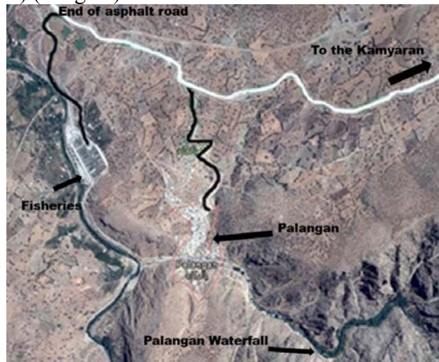
Image1: Palangan geographical location

castle of Hassanabad in Sanandaj around 16000 AD (around 980 solar and 1010 Lunar) has been the head of the Ardalan government for more than 400 years. Palangan was the center of the Ardalan government before the time of Haloo Khan Ardalan (969-995) (Zandi, Najafi, 2017) (Image 1).